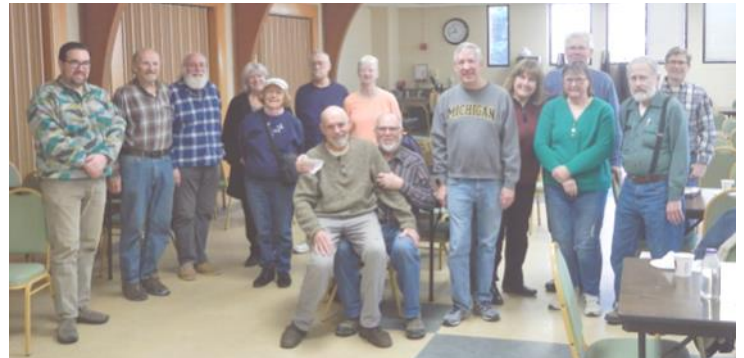
Membership meeting attendees gather afterwards for a relaxed photo.

However, we have a major concern about a PLANNED $5 million project that is based on new bridges and trails. While we support trails, it has long been HNPA's position that keeping the Preserve sectional in nature (as it currently exists), is a better option for the Preserve, users and for taxpayers. We hope to convince Parks to revise this project. Doing so would reduce the need for major bridge construction; substantially reduce construction costs and future maintenance costs. Building something is wonderful, but so is