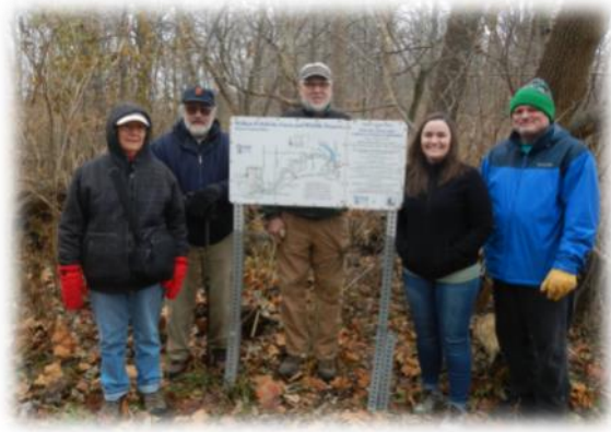
December walk in Ellsworth. This sign (although several hundred yards from Hines Drive) somehow got run over by truck. It was repaired and relocated to prevent a reoccurrence.