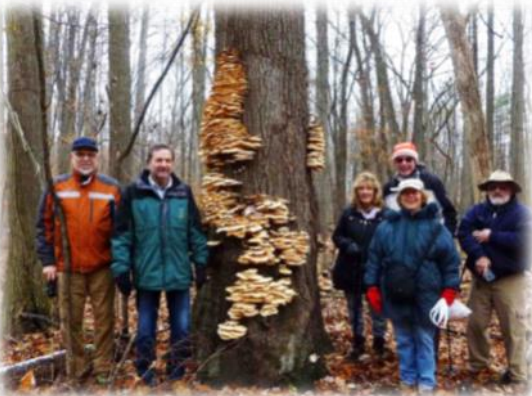
November walk in Cowan. Some funguys and fungals looking at fungi. This is a white oak, one of many killed by gypsy moths. Now decaying, it still is of value to insects, birds and more.