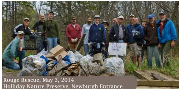
Rouge Rescue, May 3, 2014 Holliday Nature Preserve, Newburgh Entrance

A big "thank you" to all those who braved the elements and cheer-