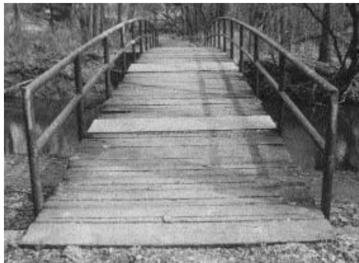
Bridge accessing the Ellsworth Trail near Nankin Mills.

2. Repair the bridge near the Three Fires parking lot , (see photo on page 3) near the former Nankin Mills Inn on Ann Arbor Trail (west of Farmington Road). This bridge is important in that it allows access to the trail running along the Middle Rouge.