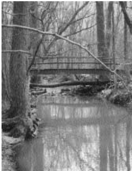
Bridge near Three Fires Parking lot. The bridge is needed to allow passage over Tonquish Creek. See Priority 2 in front page Bridge story.

6. Restrict access to unsafe, non-essential bridges pending repairs or demolition.