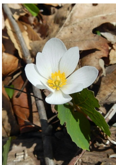
Bloodroot: A sign of Spring!

Please join in! Our walks last 90-minutes or so. Activity lengths vary but stay as long as you can. Make sure you check our Facebook page for updates during these uncertain times, since events are subject to change.