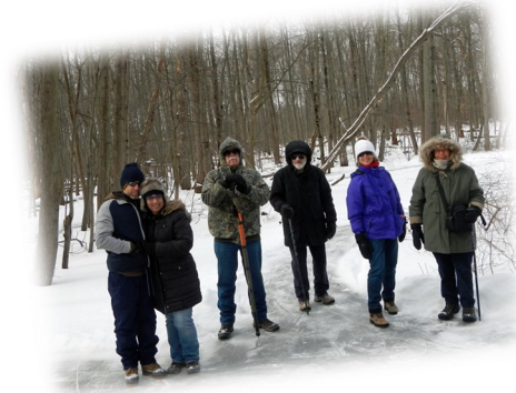
January walk in Cowan. (13F degrees) Well bundled up walkers stepped on the ice covered pond, which someone shoveled off for ice skating.