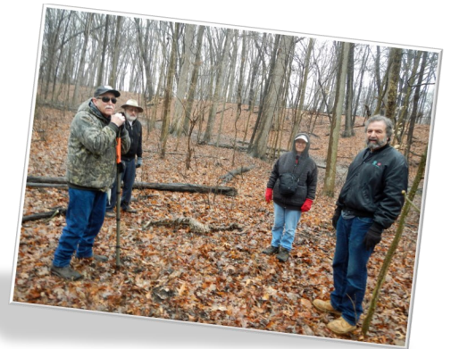
March walk in Ellsworth. (45F degrees, light rain) The last day of Winter was enjoyed by small group who trekked both on and off trail.