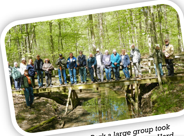
May 8: Parking in Hix Park a large group took long, slow walk to see the Egret rookery. Hard to find unless birds noisy on nests.