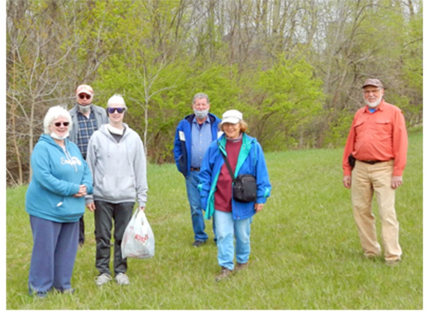
April 24: Our Earth Day walkers first looked for wildflowers, then several stayed to do some work in overgrown Newburgh field.