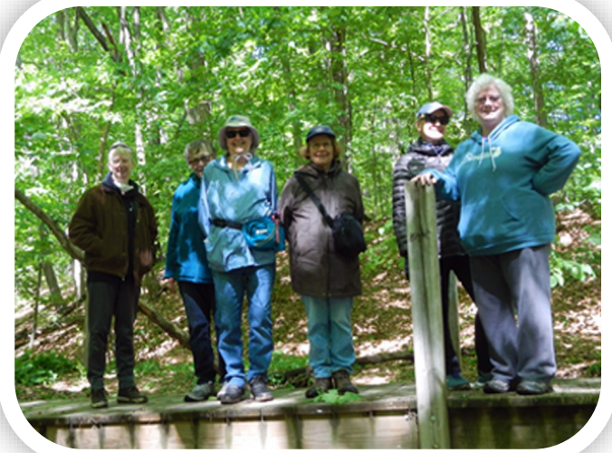
May 29: Ellsworth loop walk was last event without MOSQUITOES. Mosquitoes gladly welcomed all Holliday Preserve visitors during the summer but will be GONE during our fall and winter walks.